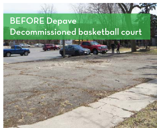
BEFORE Depave Decommissioned basketball court