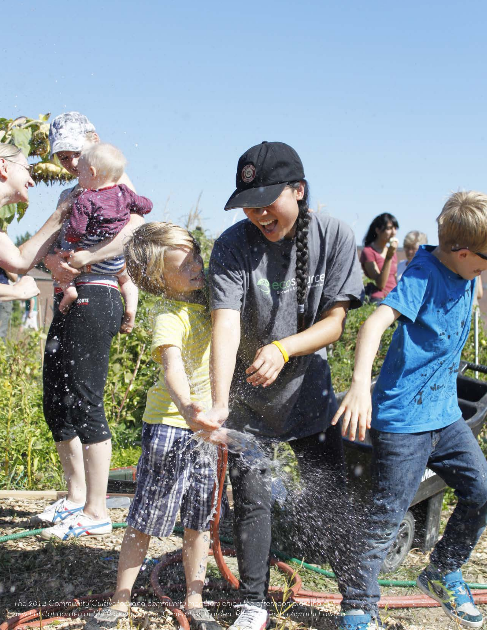
The 2014 Community Cultivators and community members enjoy the afternoon planting our new habitat garden at the Parkway Green Generation Garden.