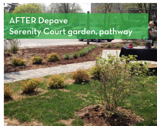
AFTER Depave Serenity Court garden, pathway