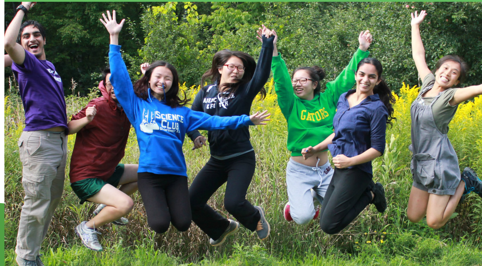
PEYA Executive and Advisory Committee members pose for the camera at the 2014 PEYA Summer Leadership Training Retreat.

students, teachers, and community members reached through Ecosource environmental education programs in the past year.